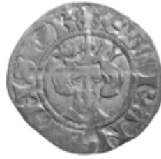
Durham, no rose on neck lettering as class 4 (large letters, open C)